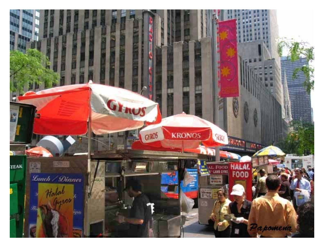
People who have never been to New York have misunderstood me My friends and family work in the industries, professions and businesses that benefit all Americans My firefighters died trying to save New Yorkers and non-New Yorkers They died trying to save Americans and non-Americans Because they were New Yorkers.

I am a New Yorker I was raised on cultural diversity before it was politically correct I eat Greek food and Italian food, Jewish and Middle Eastern food and Chinese food Because they are all American food to me. I don't get mad when people speak other languages in my presence Because my relatives got to this country via Ellis Island and chose to stay They were New Yorkers