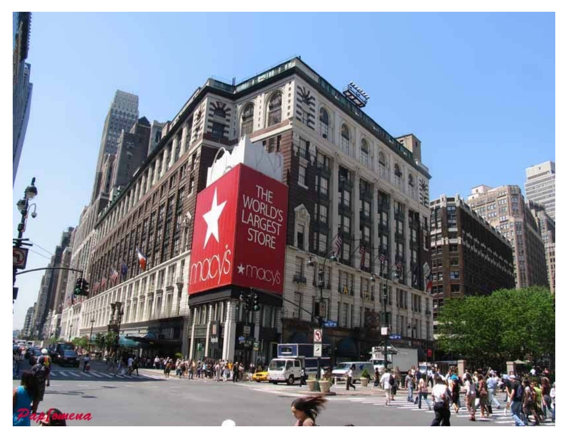
I am a New Yorker When I go on vacation, I never look up Skyscrapers are something I take for granted The Empire State Building and the Statue of Liberty are part of me Taxis and noise and subways and "get outa heah" don't rattle me Because I am a New Yorker